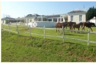
Bishops court - R 8 995 000