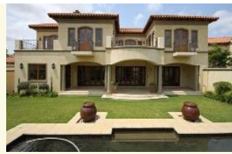
Randpark Ridge - R 1 650 000