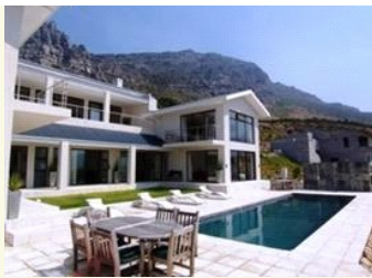
Weltevredenpark - R 1,100,000