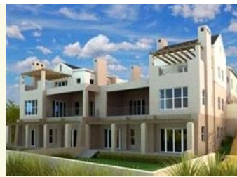
Rietfontein - R 1,100,000