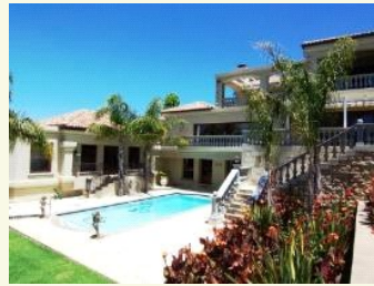
Constantia - R 27,000,000