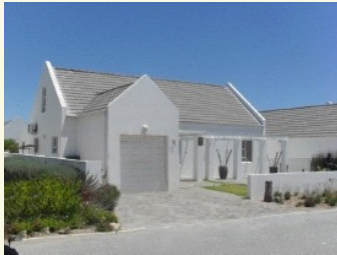
St Helena Bay - R 1 550 ,000