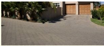
Constantia - R 10,950,000