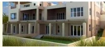
Fairland - R 3,160,000

Chas Everitt International sales agents have all the latest market information regarding local property values at their fingertips - and are committed to the highest standards of personal service when it comes to selling your home. In addition, the Chas Everitt International property group offers you, the homeowner, the best possible exposure for your property in both national and international markets. So if you are thinking of selling your home, call your nearest Chas Everitt International office today for the name of your local area specialist - or visit www.ChasEveritt.com