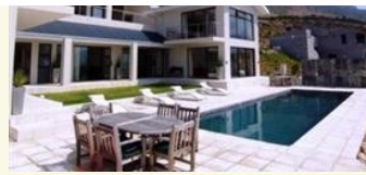
Fourways - R 1,800,000