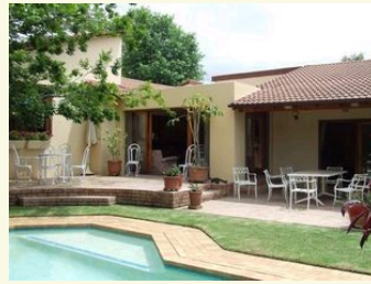
Constantia - R 19,995,000