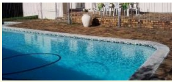
Port Elizabeth - R 480,000