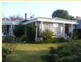
Noordhoek - R6 650 000