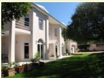
Brakpan - R1 000 000