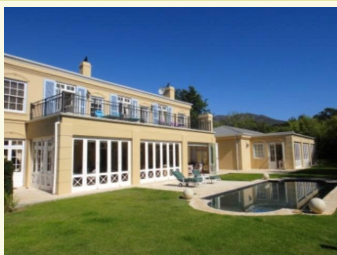
Brandhuis - R1 450 000