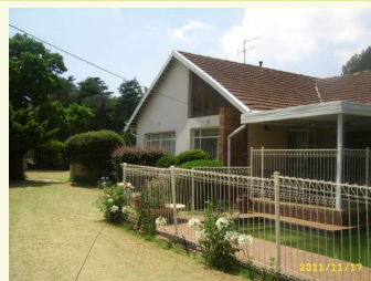
Constantia - R20 000 000