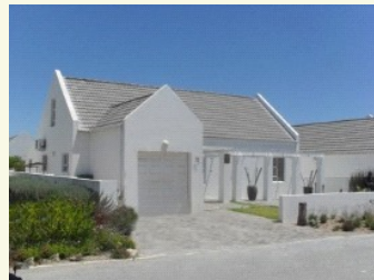
Parkview - R4 200 000