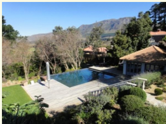
St Helena Bay - R1 450 000