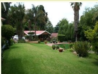
Bethlehem - R1 625 000