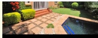
Fish Hoek - R 6,000,000