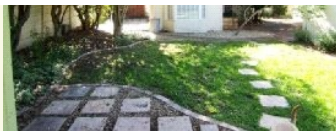
Brandvlei - R 699,000