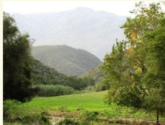
Calitzdorp - R 1,050,000