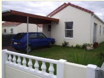
Strand - R 460,000