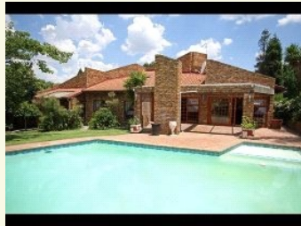
Randpark Ridge - R 2,300,000