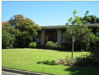
Bellville - R 1,495,000