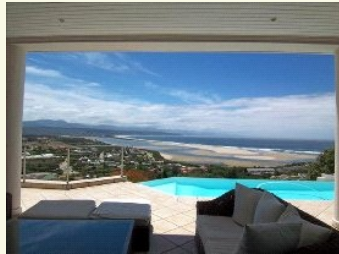
Plettenberg Bay - R 17,900,000