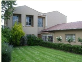
Modderfontein - R 1,850,000