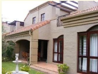
Sunninghill - R 1,550,000