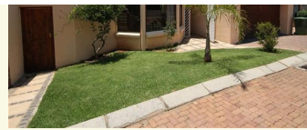
St Helena Bay - R 1,450,000