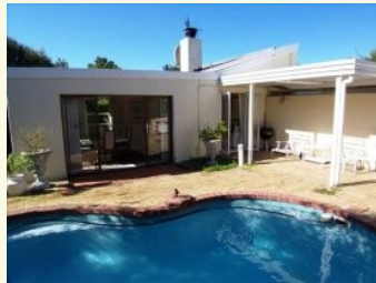
Constantia - 2,195,000