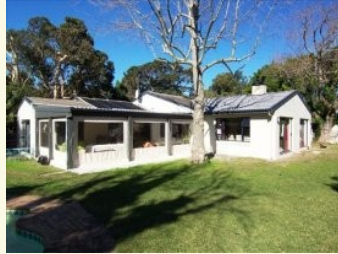
Constantia - R 3,750,000