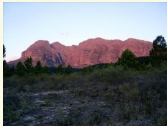
Paarl - R 1,400,000