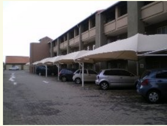
Amberfield - R 510,625