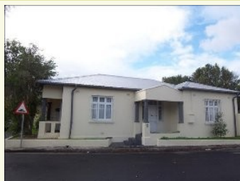
Claremont - R 980,000