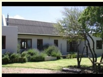
Noordhoek - R 2,500,000