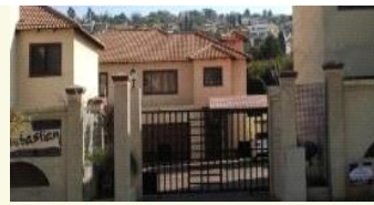
Bishopscourt - R 10,000,000