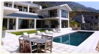
St Helena Bay - R 1,550,000